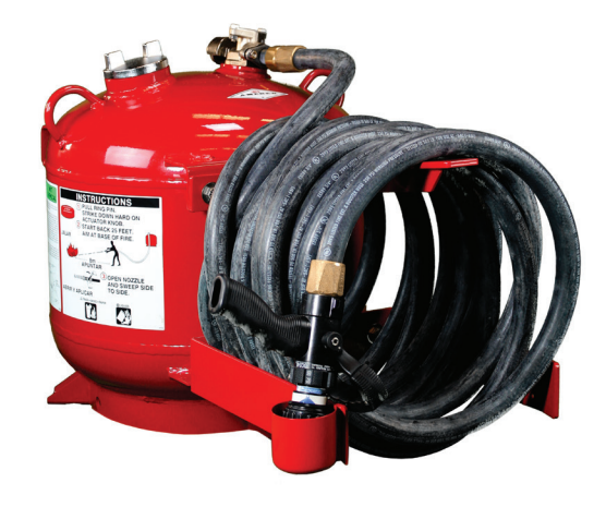
Model 784 Shown