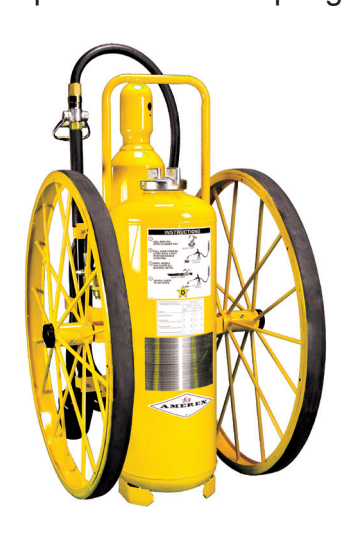
Extension Wand is Standard

Two choices for large volume Class D (flammable metal) protection. Model 680 (Sodium Chloride) is effective on magnesium, sodium, potassium and sodium potassium alloy fires. Model 681 (Copper Powder) designed specifically for fighting difficult lithium fires. Well balanced for quick transport on 36" non-sparking rubber tread steel wheels. Both are pressurized with Argon and regulated to a low 125 psi to avoid disrupting the burning materials.